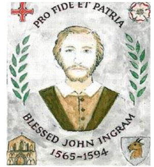
The John Ingram Partnership Diocese of Hexham and Newcastle