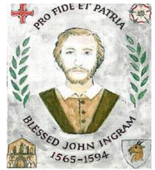
The John Ingram Partnership Diocese of Hexham and Newcastle