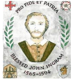
The John Ingram Partnership Diocese of Hexham and Newcastle