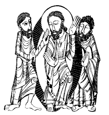
And a voice came from the cloud saying, 'This is my Son, the Chosen One. Listen to him.' Luke 9:35