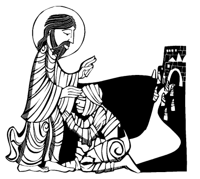
Jesus said to the man, 'Stand up and go on your way. Your faith has saved you.'