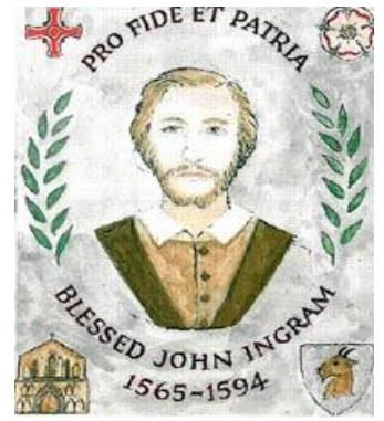
The John Ingram Partnership Diocese of Hexham and Newcastle