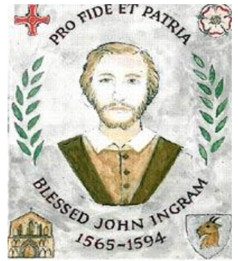
The John Ingram Partnership Diocese of Hexham and Newcastle