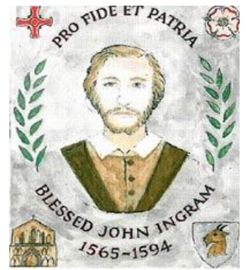
The John Ingram Partnership Diocese of Hexham and Newcastle