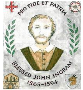
The John Ingram Partnership Diocese of Hexham and Newcastle