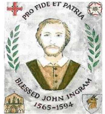
The John Ingram Partnership Diocese of Hexham and Newcastle