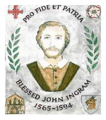
The John Ingram Partnership Diocese of Hexham and Newcastle