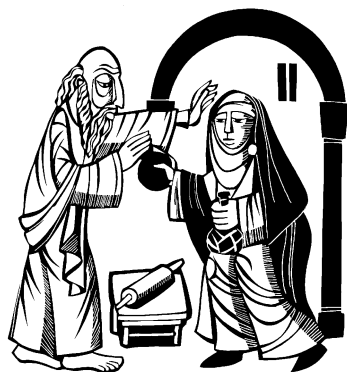
The Prophet Elijah and the widow of Sidon (see today's first reading, I Kings 17:10-16)